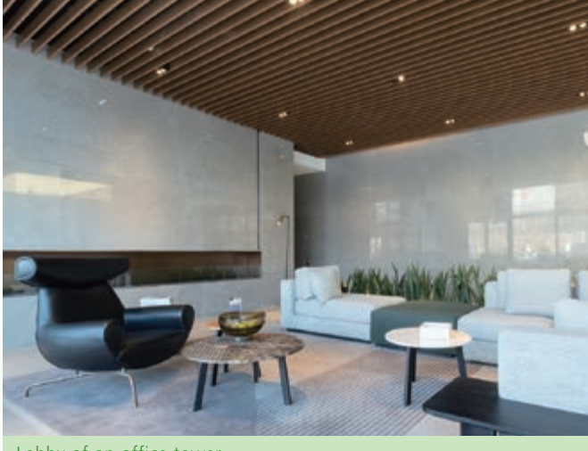
Lobby of an office tower

Regal Renaissance, a composite commercial/office/residential development in a prime location of Hedong District, Tianjin