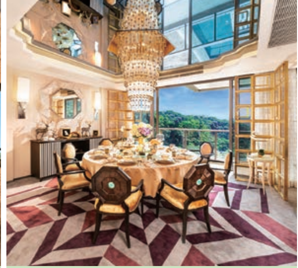
Dining room of a garden house