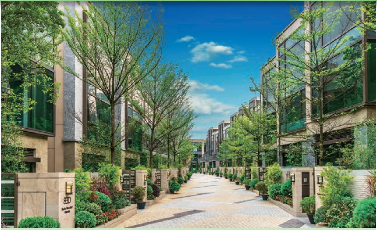
Casa Regalia, the garden houses in the residential development at Nos. 65-89 Tan Kwai Tsuen Road, Yuen Long, New Territories