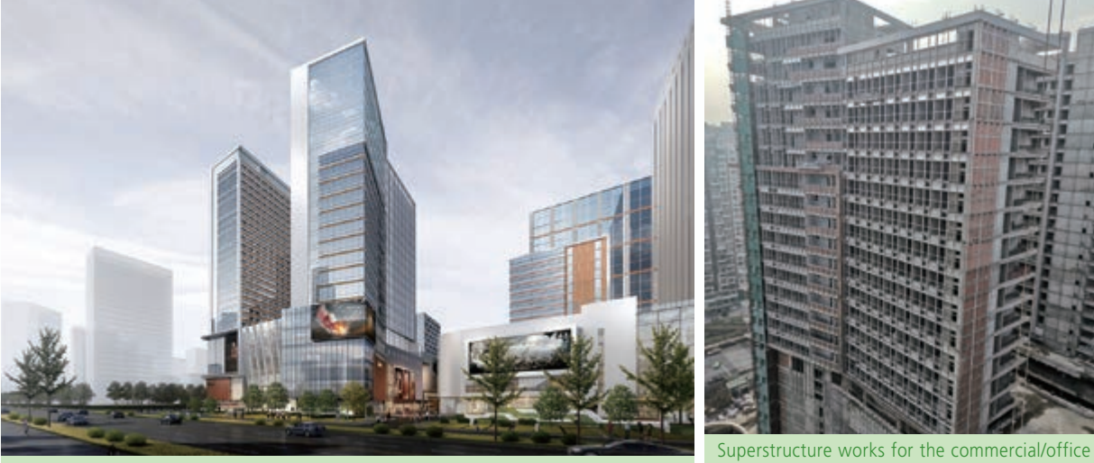
Commercial/office towers of Regal Cosmopolitan City (*)

Regal Cosmopolitan City, a composite residential/commercial/office/hotel development in Xindu District, Chengdu, Sichuan (*)