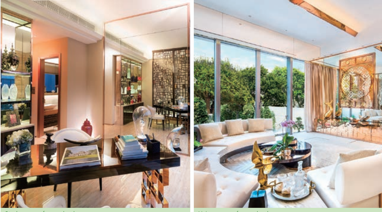
Study room of a garden house