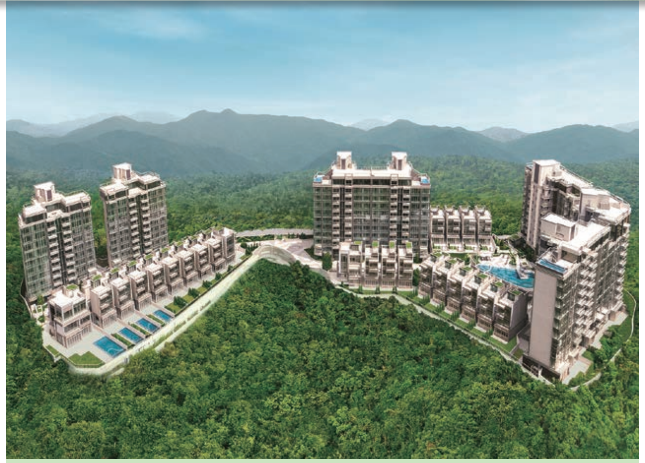
Mount Regalia, a luxurious residential development at 23 Lai Ping Road, Kau To, Sha Tin, New Territories