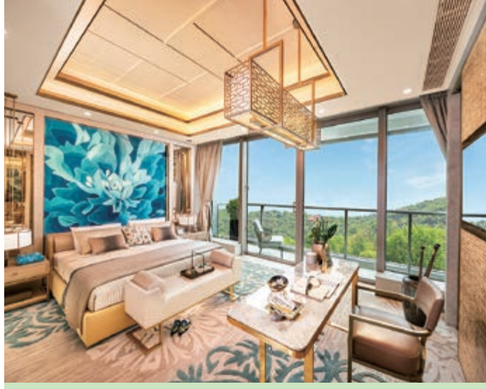
Master bedroom of a garden house