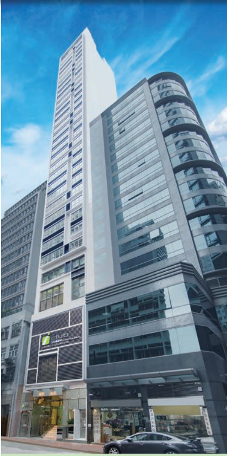
iclub AMTD Sheung Wan Hotel at No. 5 Bonham Strand West, Sheung Wan, Hong Kong