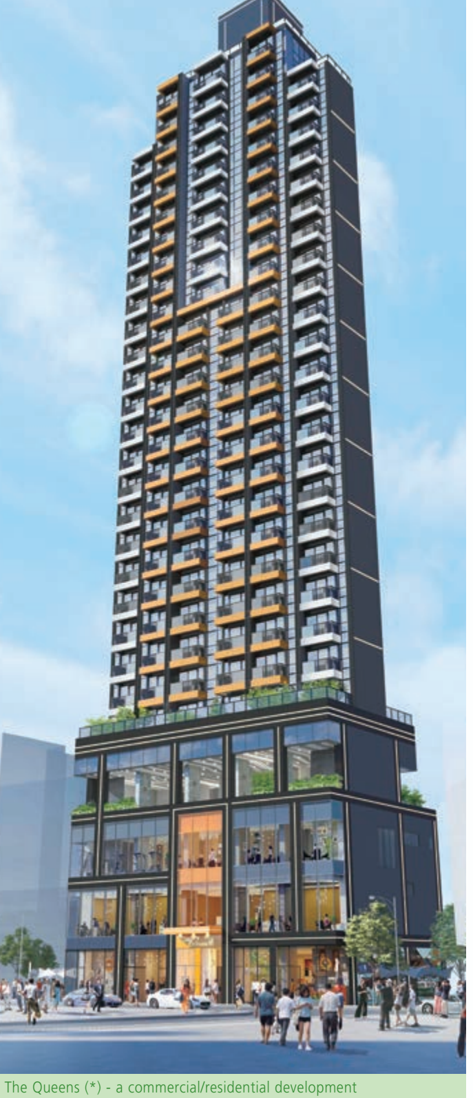
at No. 160 Queen's Road West, Hong Kong