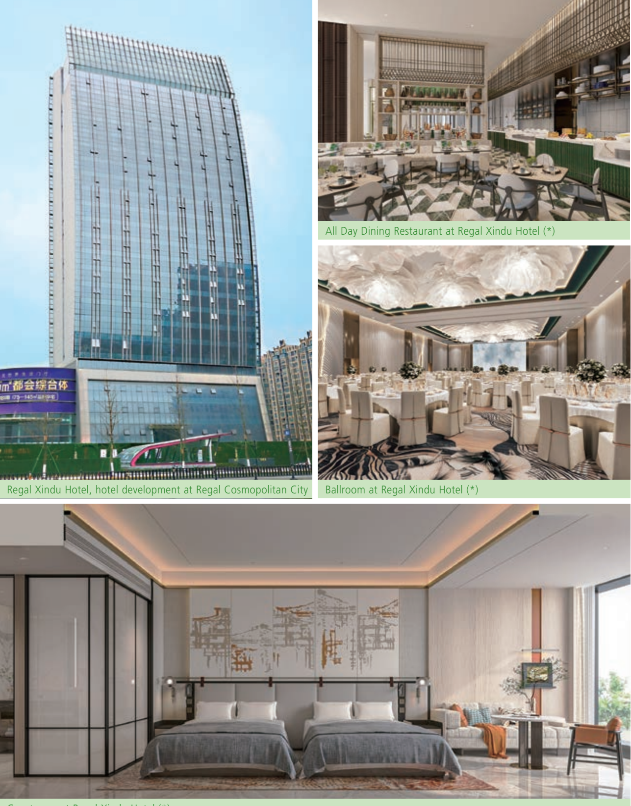
Guestroom at Regal Xindu Hotel (*)