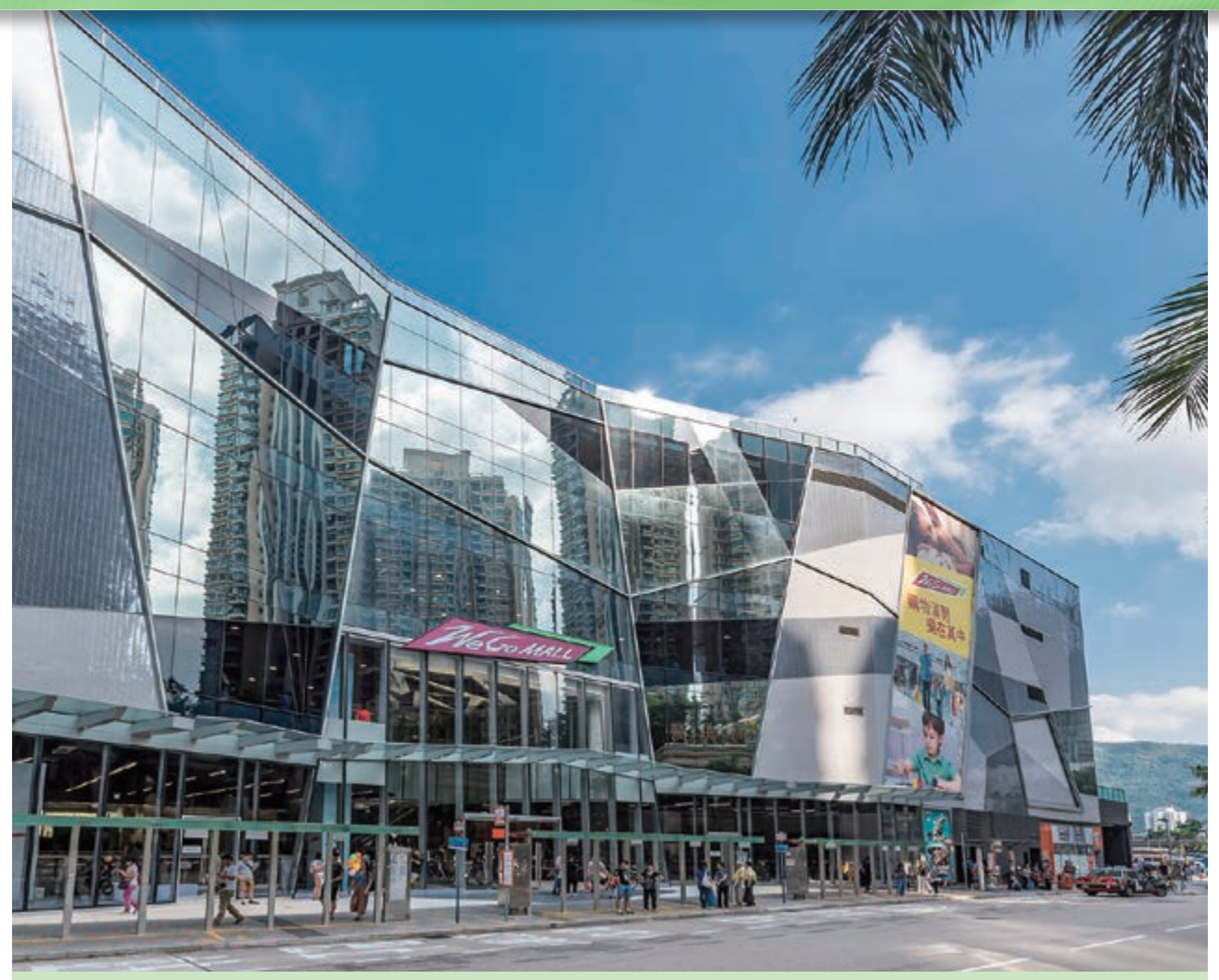
We Go MALL, a shopping mall at No. 16 Po Tai Street, Ma On Shan, Sha Tin, New Territories