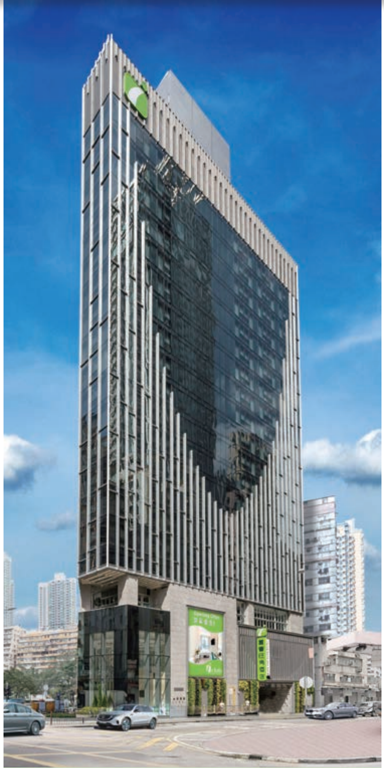
iclub Mong Kok Hotel at 2 Anchor Street, Tai Kok Tsui, Kowloon, Hong Kong