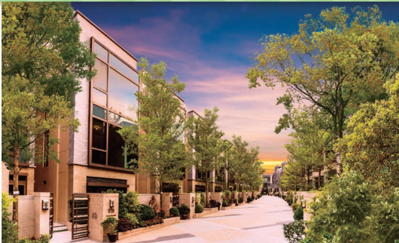
Casa Regalia, the garden houses in the residential development at Nos. 65-89 Tan Kwai Tsuen Road, Yuen Long, New Territories