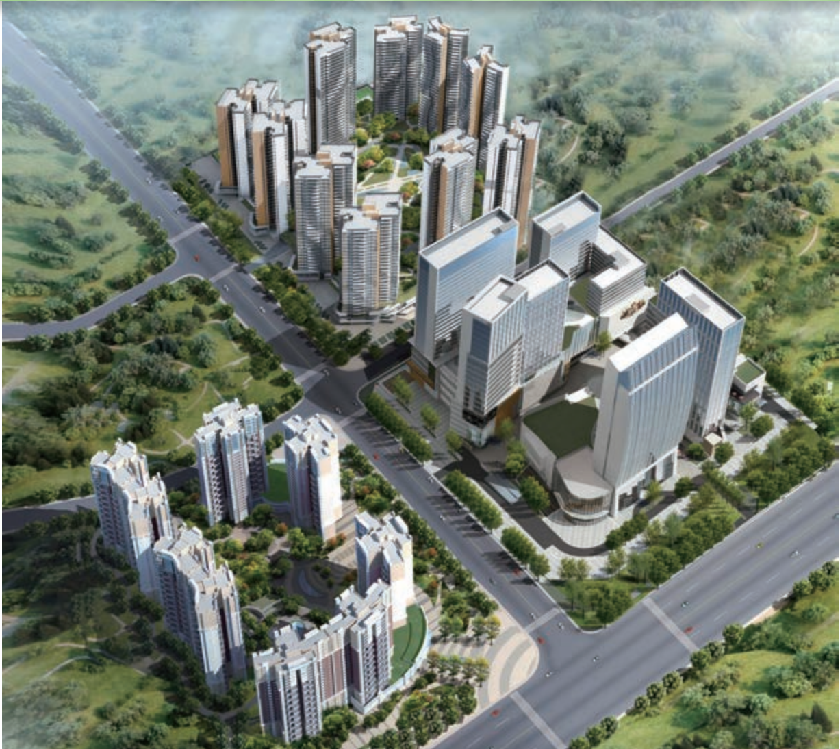
Regal Cosmopolitan City, a composite hotel/commercial/office/residential development in Xindu District, Chengdu, Sichuan (*)