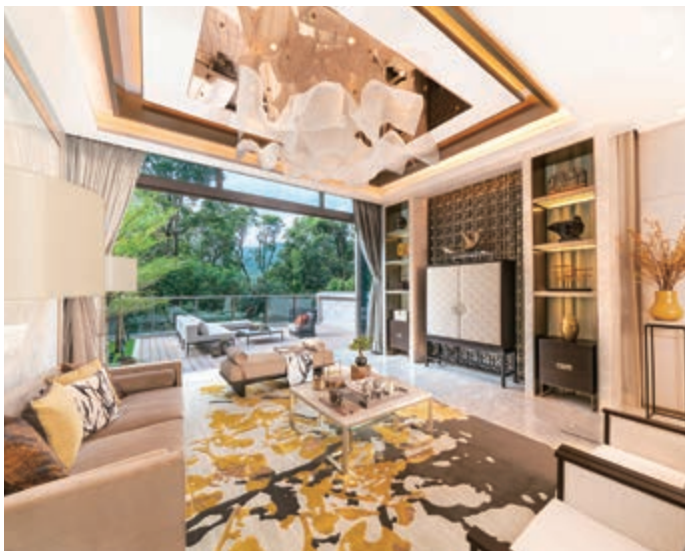
Living room of a garden house