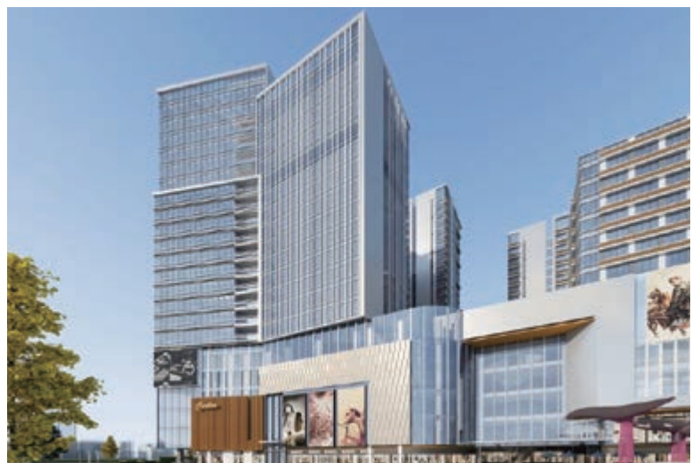
Commercial/office towers of Regal Cosmopolitan City (*)