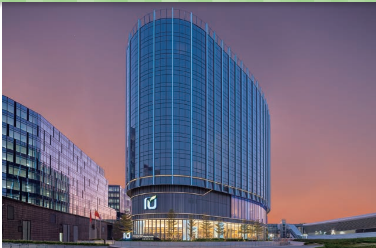
Regala Skycity Hotel at Chek Lap Kok Lot No. 3, Hong Kong International Airport