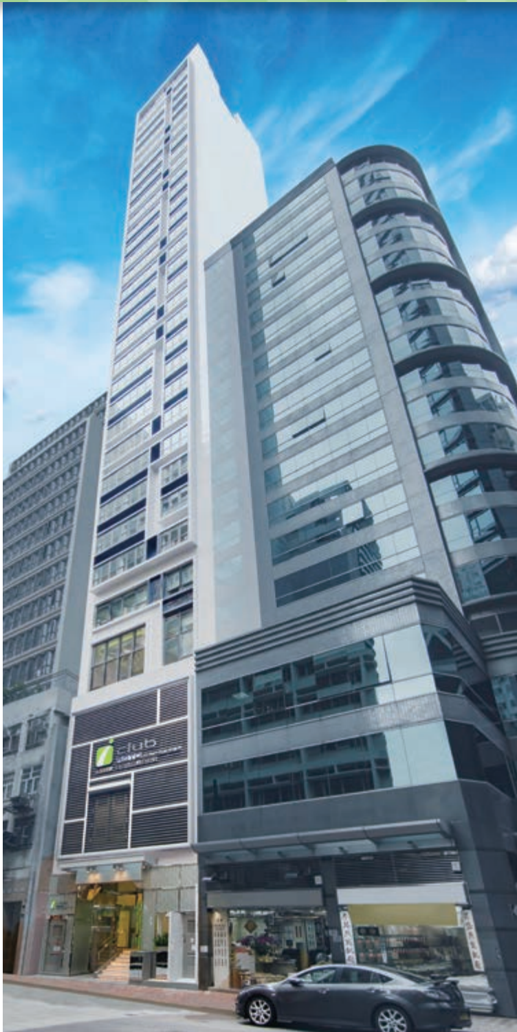
iclub AMTD Sheung Wan Hotel at No. 5 Bonham Strand West, Sheung Wan, Hong Kong