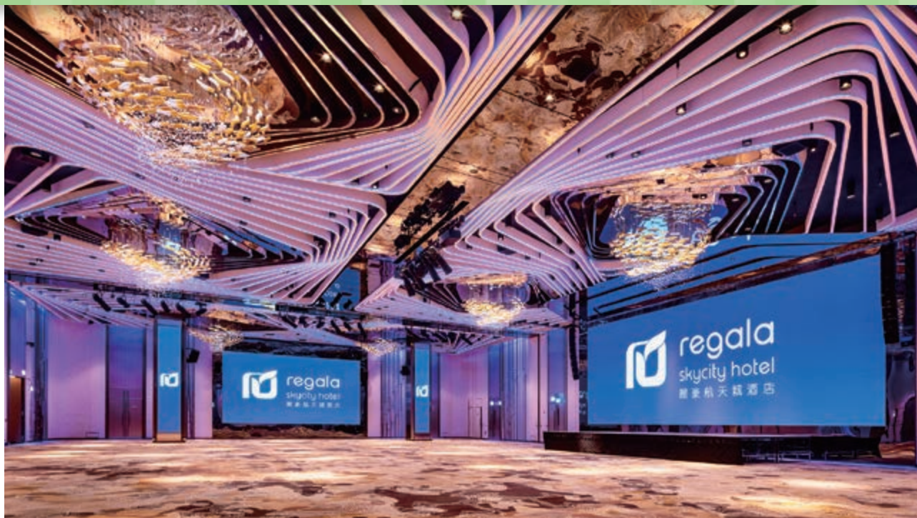
Ballroom - Palladium