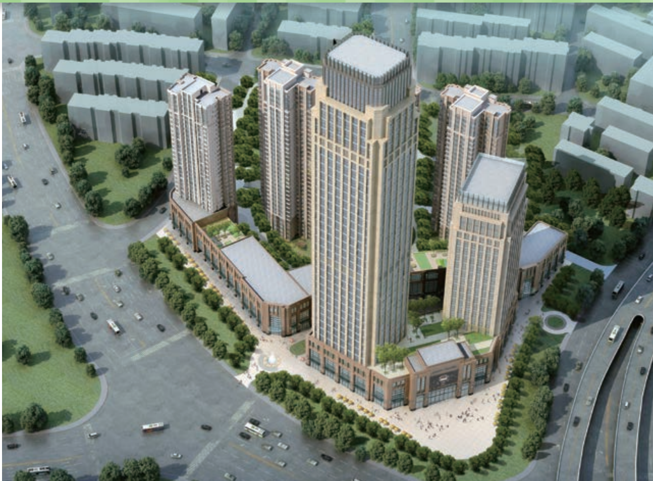
Regal Renaissance, a composite commercial/office/residential development in a prime location of Hedong District, Tianjin (*)