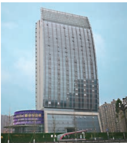
Regal Xindu Hotel, hotel development at Regal Cosmopolitan City