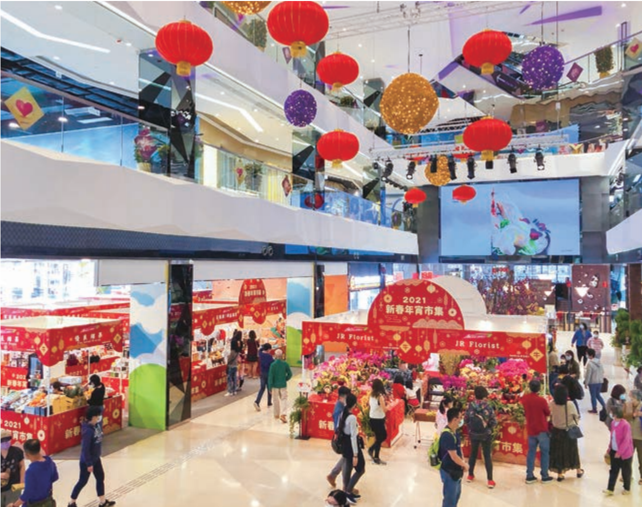
Chinese New Year market