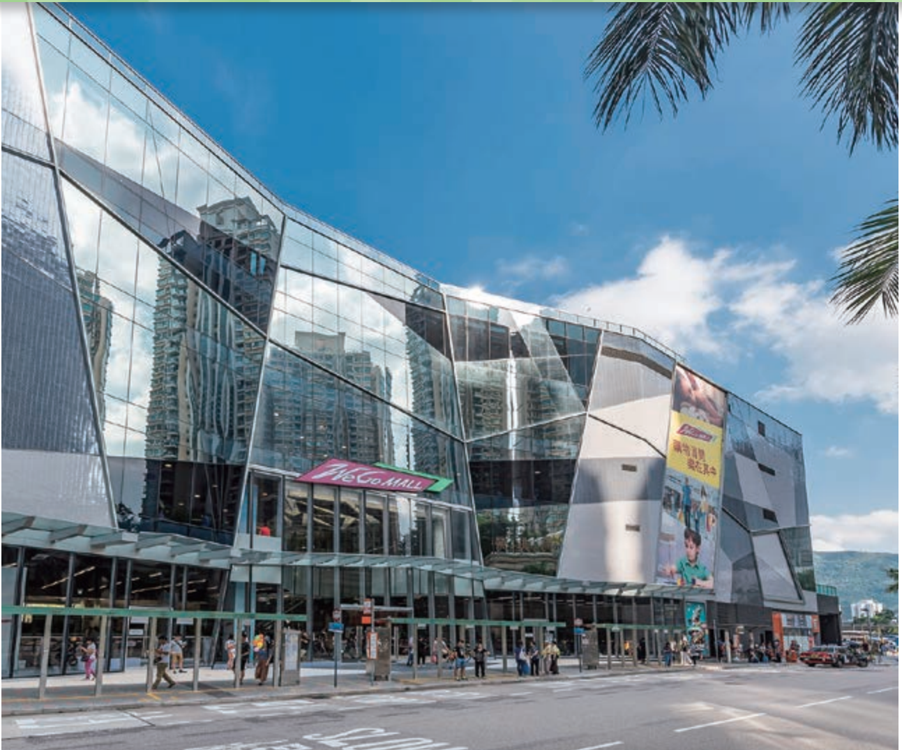
We Go MALL, a shopping mall at No. 16 Po Tai Street, Ma On Shan, Sha Tin, New Territories