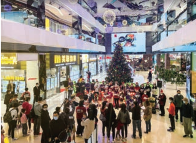
Christmas carol singing