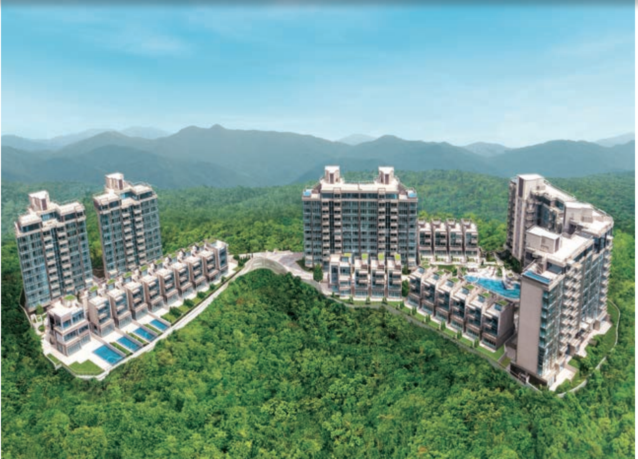
Mount Regalia, a luxurious residential development at 23 Lai Ping Road, Kau To, Sha Tin, New Territories