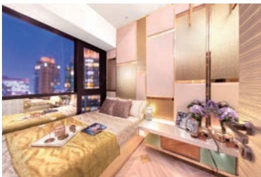
Master bedroom of a show flat