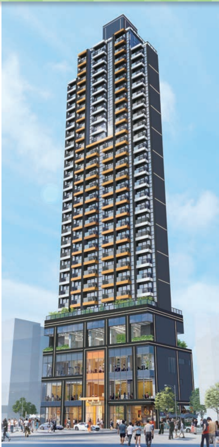
The Queens (*) - a commercial/residential development at No. 160 Queen's Road West, Hong Kong