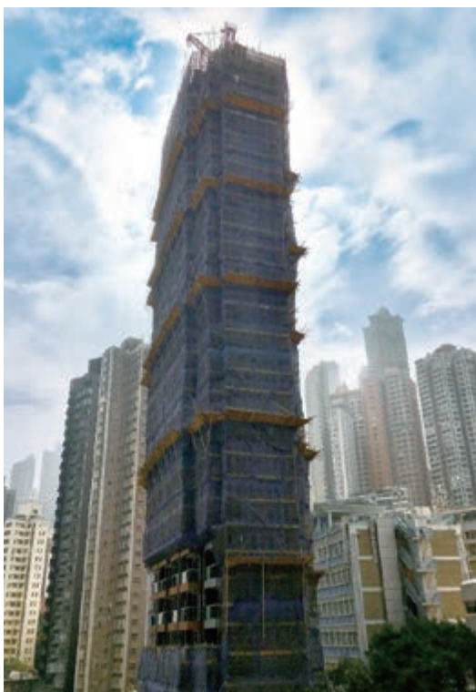
Superstructure works in progress