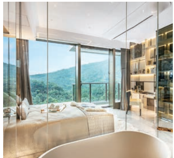
Master bedroom of a garden house