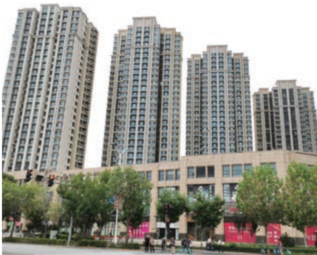
Residential towers and commercial complex of Regal Renaissance - completed