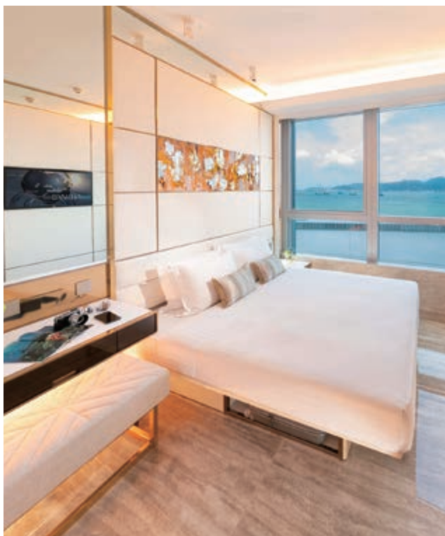
Premier Seaview Room