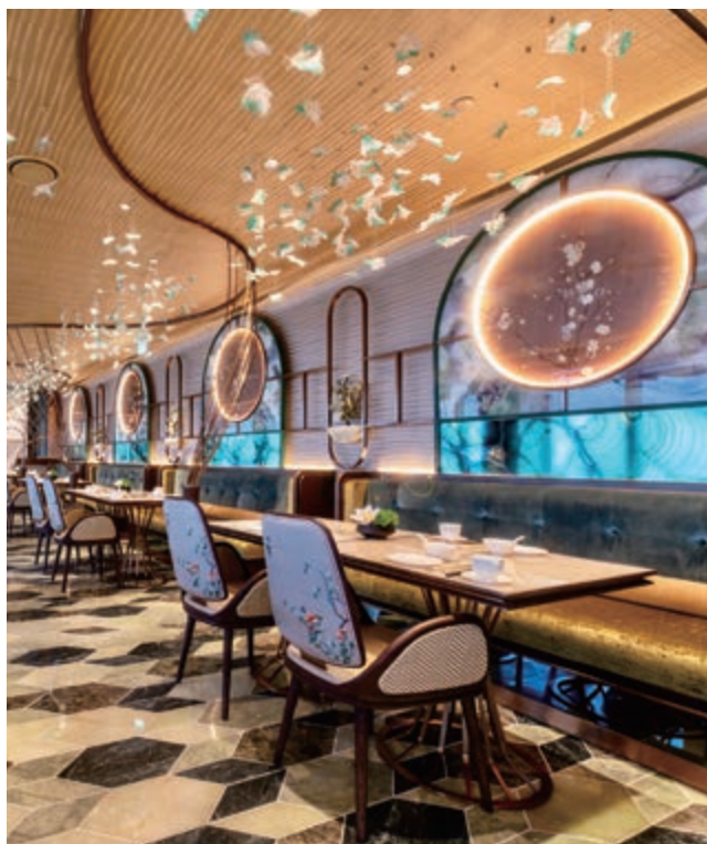
Chinese Restaurant - the Jade