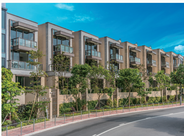
Exterior view of the garden houses at Casa Regalia