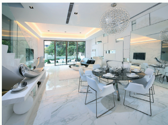
Living room of a garden house