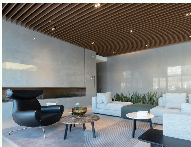
Lobby of an office tower