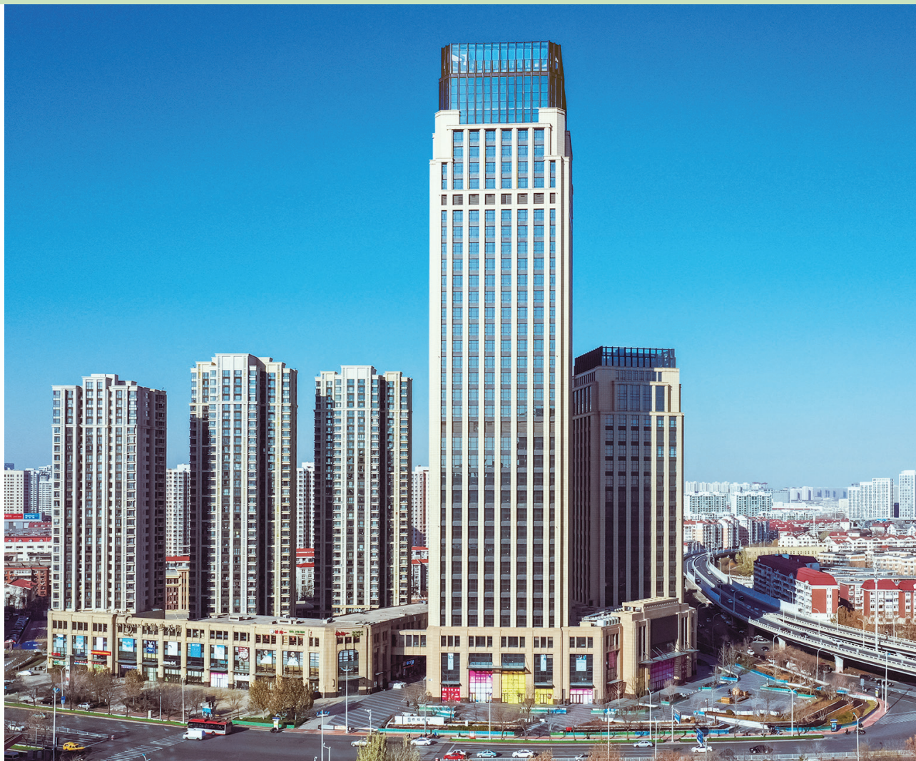
Regal Renaissance, a composite commercial/office/residential development in a prime location of Hedong District, Tianjin