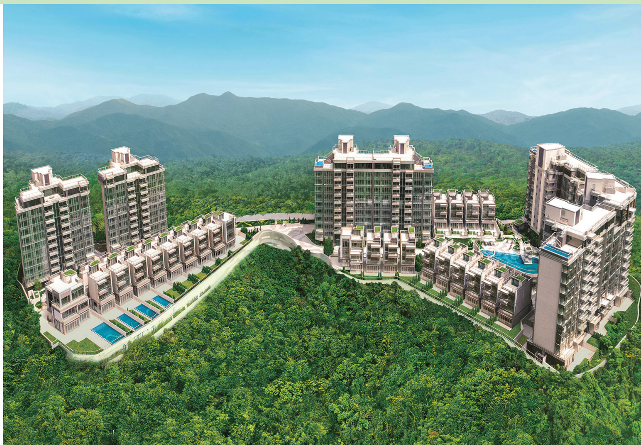
Mount Regalia, a luxurious residential development at 23 Lai Ping Road, Kau To, Sha Tin, New Territories