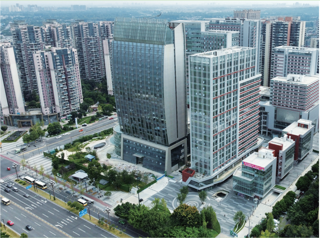
Regal Cosmopolitan City - Hotel and commercial/office towers