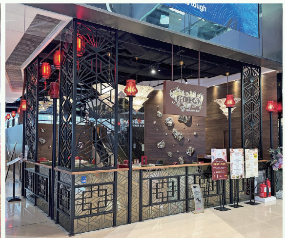
Chinese restaurant - Dragon Inn