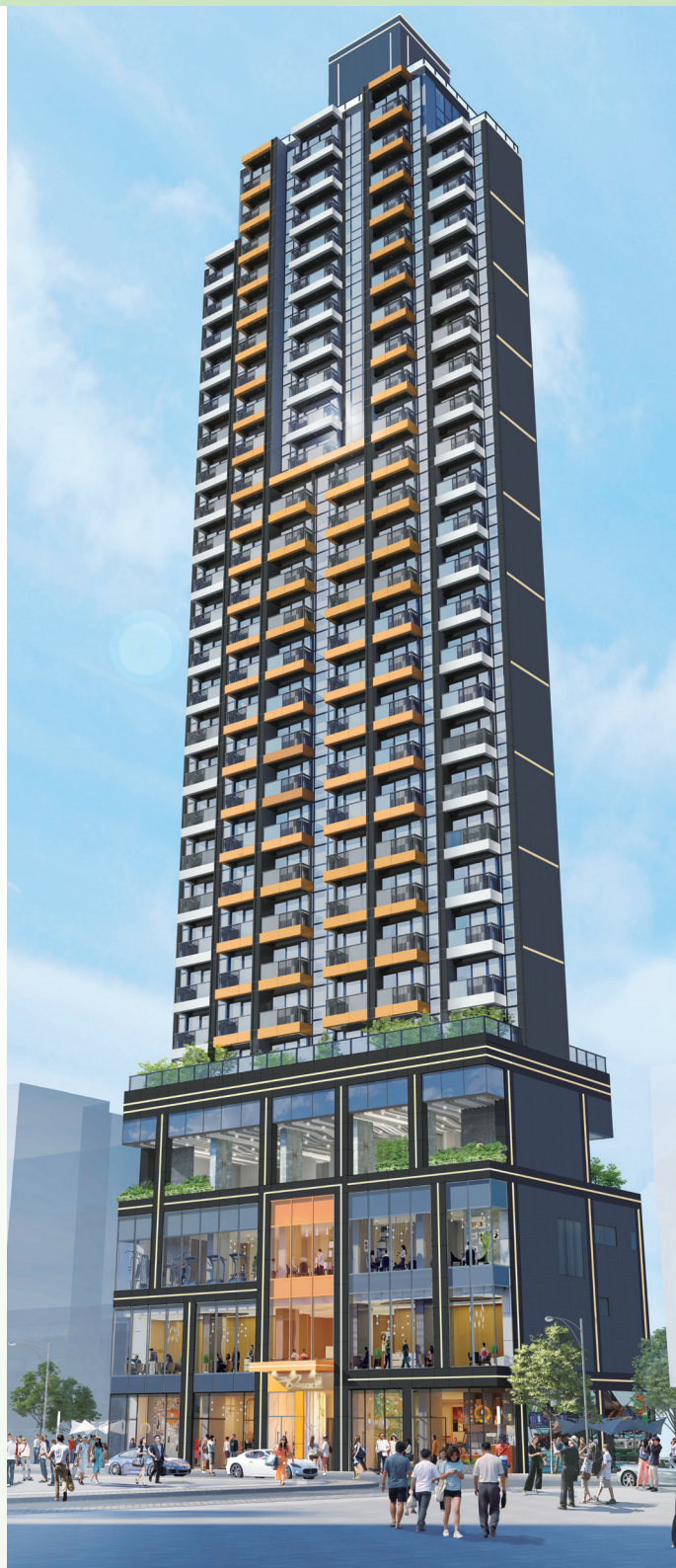
The Queens (*) - a commercial/residential development at No. 160 Queen's Road West, Hong Kong