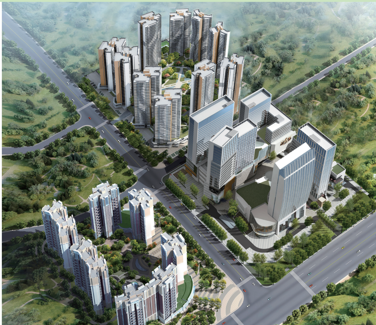
Regal Cosmopolitan City, a composite residential/commercial/office/hotel development in Xindu District, Chengdu, Sichuan (*)