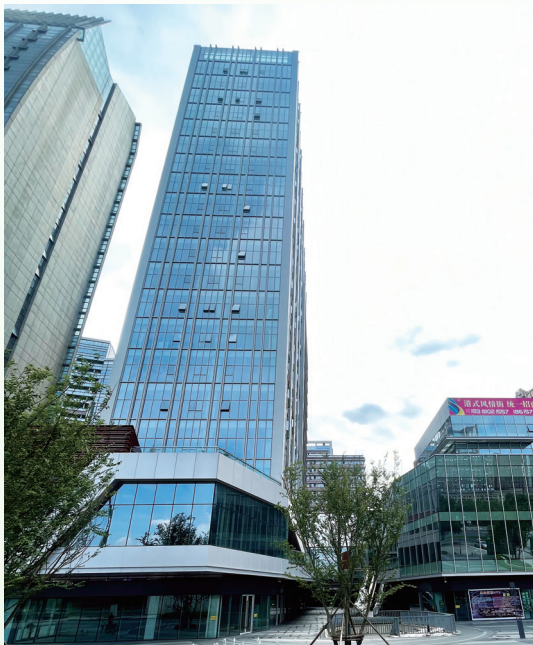
Hotel and commercial/office towers