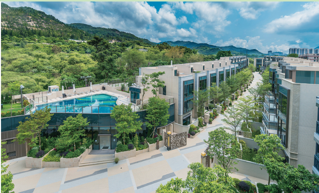
Casa Regalia, the garden houses in the residential development at Nos. 65-89 Tan Kwai Tsuen Road, Yuen Long, New Territories