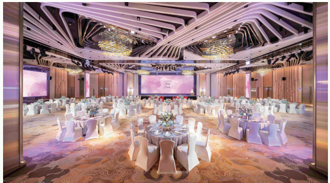
Regala Grand Ballroom