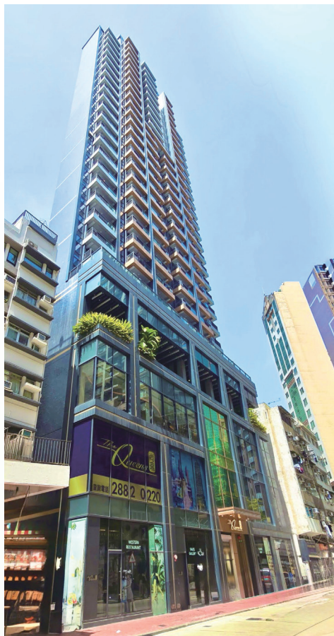
Completed in August 2022