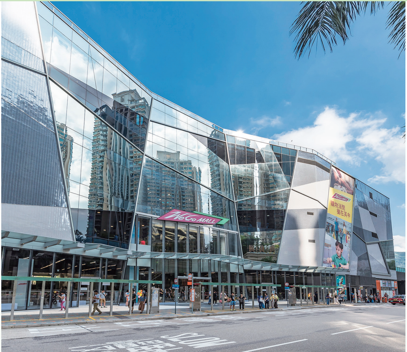
We Go MALL, a shopping mall at No. 16 Po Tai Street, Ma On Shan, Sha Tin, New Territories