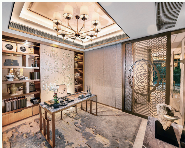
Study room of a garden house