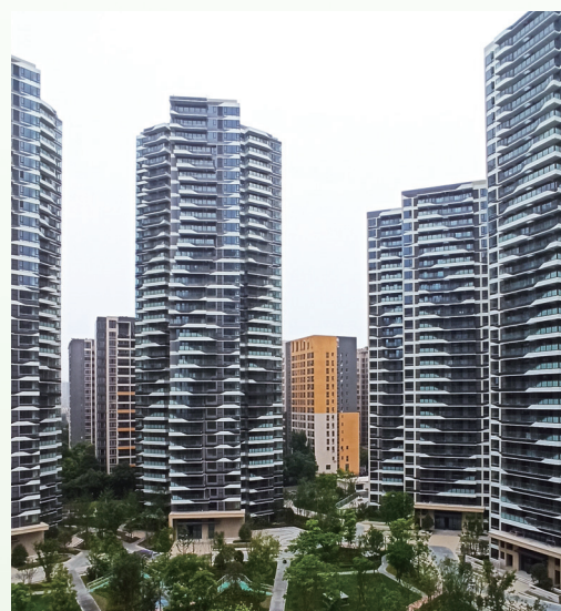
Casa Regalia (Phase 1 and Phase 2) - residential component of Regal Cosmopolitan City