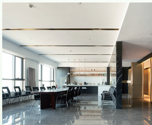
Multi-functional room in an office tower