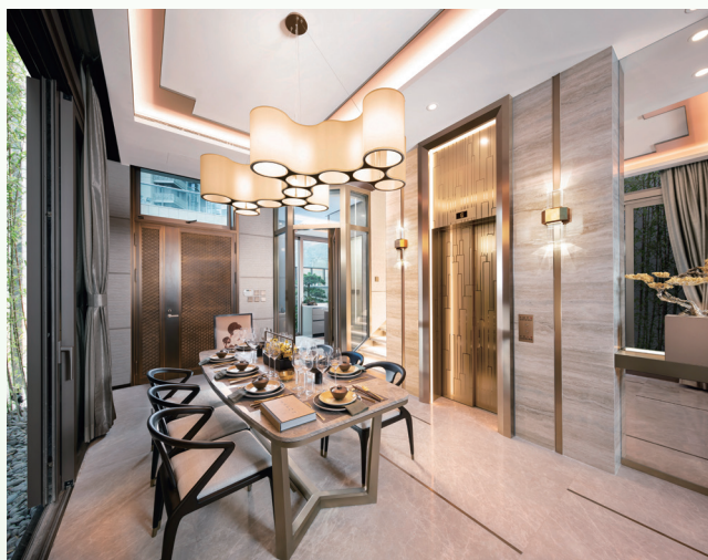
Dining room of a garden house