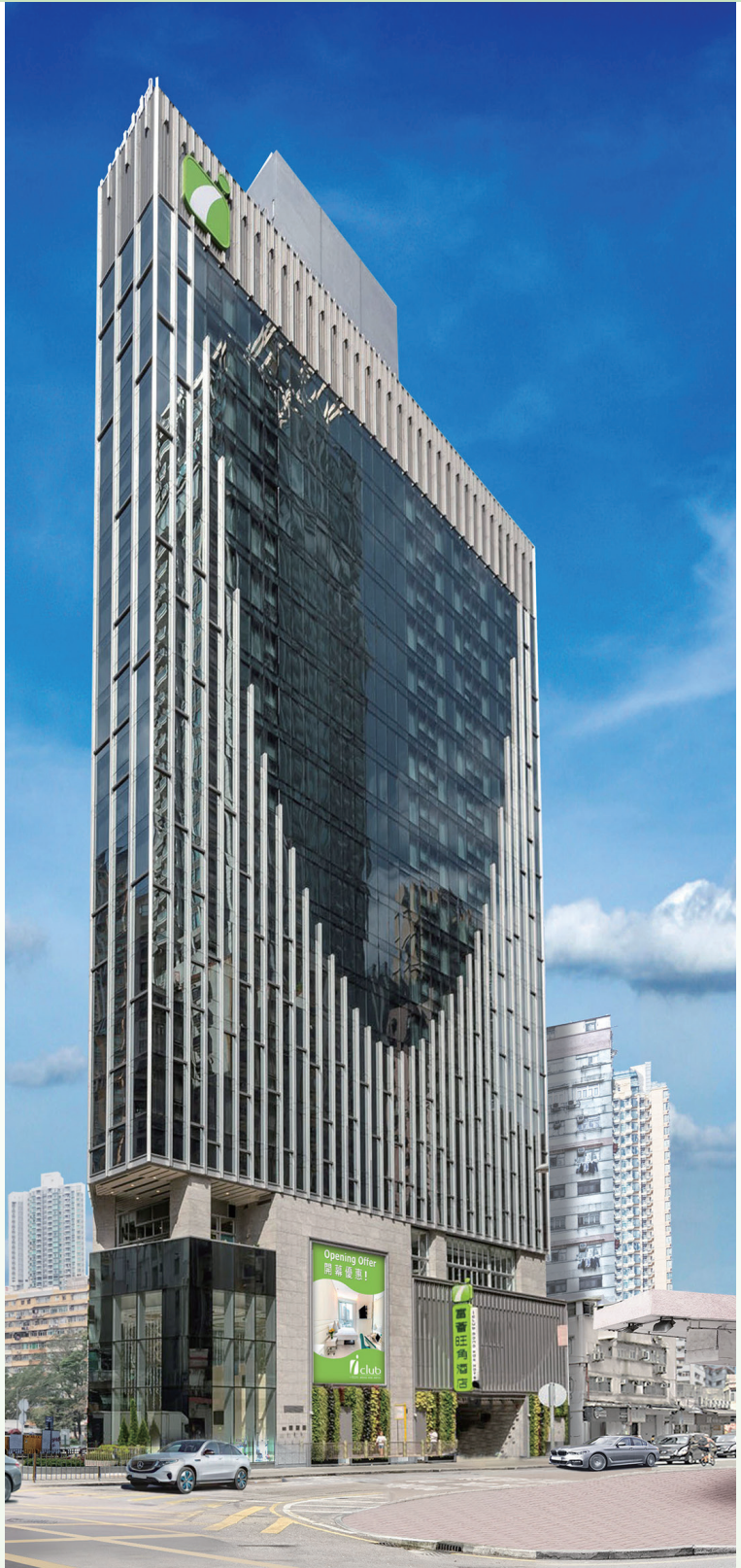
iclub Mong Kok Hotel at 2 Anchor Street, Mong Kok, Kowloon, Hong Kong