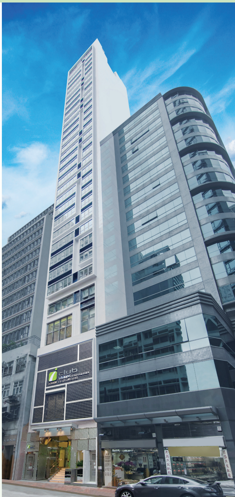
iclub AMTD Sheung Wan Hotel at No. 5 Bonham Strand West, Sheung Wan, Hong Kong