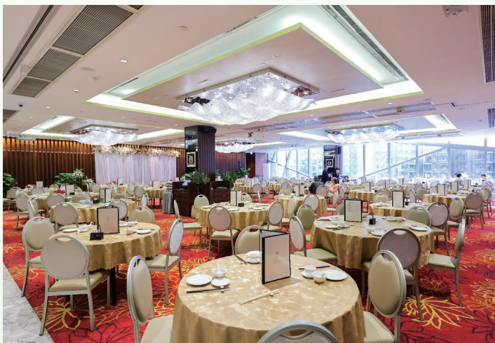
Chinese restaurant - Dragon Terrace